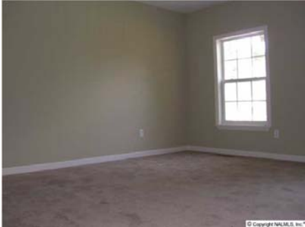
King Size Bed? No problem... you will still have room for a full suite of furniture in this master suite!