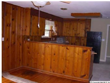
The updated kitchen retains the original cabinets, tiel floor, and all new appliances.