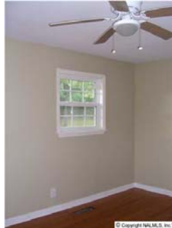
Smooth Ceilings, hardwood floors, and ceiling fan in the 2nd bedroom