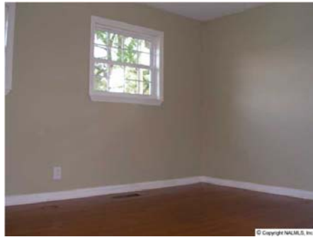
Bedroom number 3 has a private half bath, wood floors, and smooth ceilings