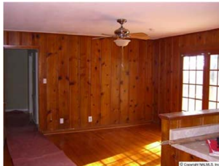
The Family Room features original pine paneling and wood floors. Could easily serve as a dining room