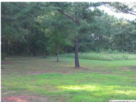
Shady Treed lot