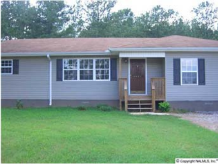
Completely New Again ! 4 Bedroom 3 Bath Home. Located just south of McKee Road on Wall Triana