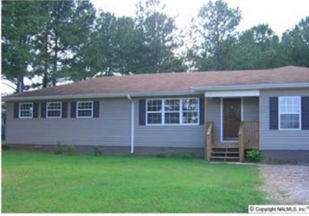
9794 Wall Triana