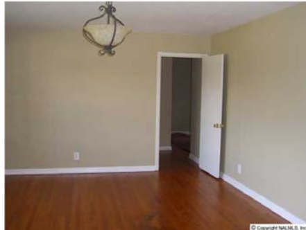
Living Room features smooth ceilings and original hardwood flooring