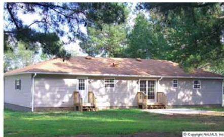
Rear Patio and lots of room for the kids to play