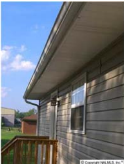
Maintenance Free Exterior