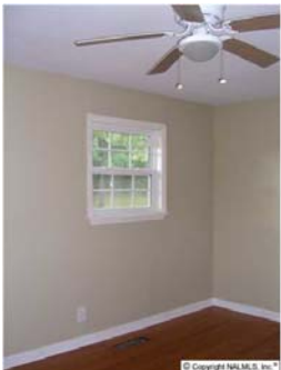
A peek at the 4th bedroom!